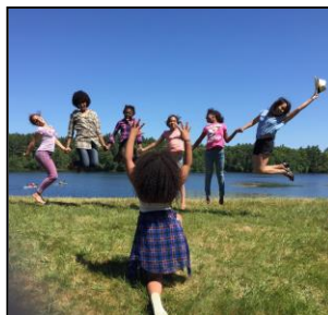
St. Peter's Teen Center dance at Lake Rico and the EBNHC Let's Get Movin' program visit the Blue Hills Reservation.