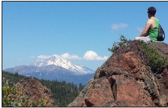
Trail work and a well-deserved break in California.